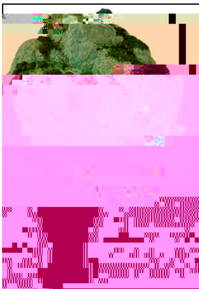
Malachite on Chrysocolla OR1